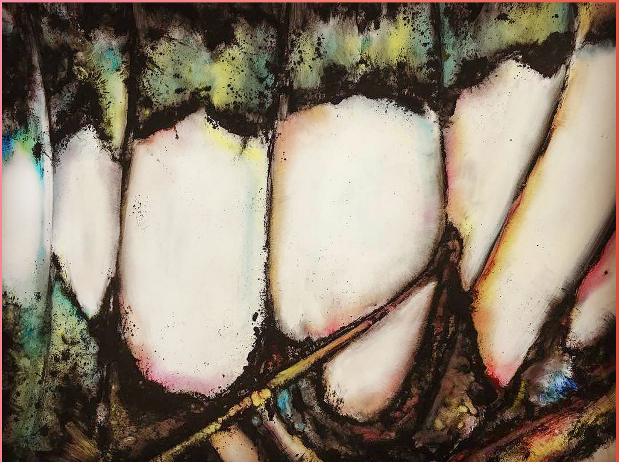
PAIN $525 Tusche Wash Painting