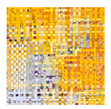
@taliajohns "Light Up", fiber, 12x12in